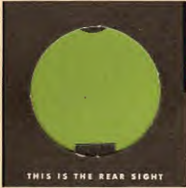
THIS IS THE REAR SIGHT

IN SIGHTING AND AIMING, THERE'S NO SUCH THING AS ALMOST RIGHT