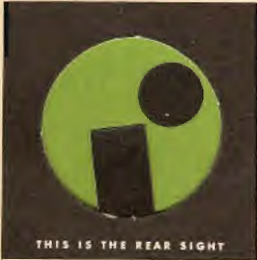
THIS IS THE REAR SIGHT

IN SIGHTING AND AIMING, THERE'S NO SUCH THING AS ALMOST RIGHT