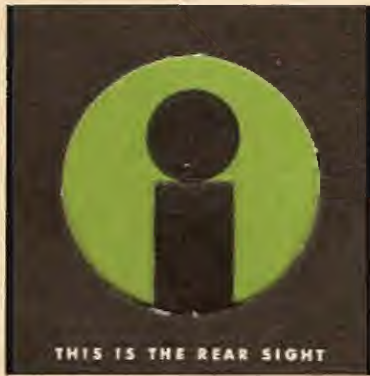
THIS IS THE REAR SIGHT

IN SIGHTING AND AIMING, THERE'S NO SUCH THING AS ALMOST RIGHT